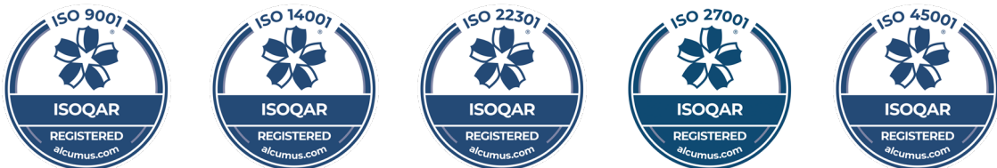
Cert No. 1122